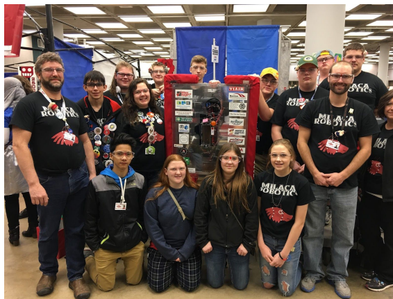
The 2015-2016 Milaca Robotics Team with the robot at Duluth regional competition.